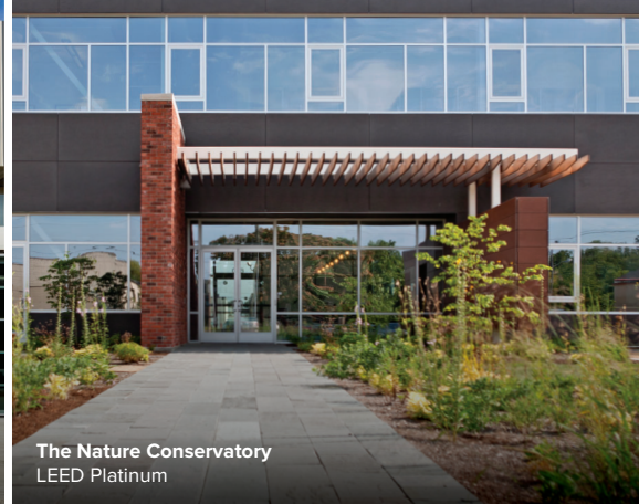
The Nature Conservatory LEED Platinum