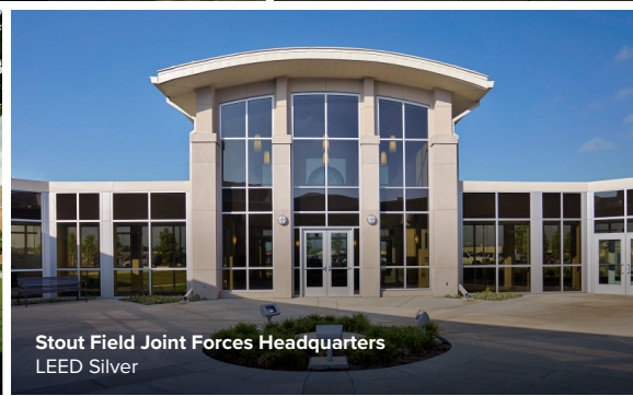
Stout Field Joint Forces Headquarters LEED Silver