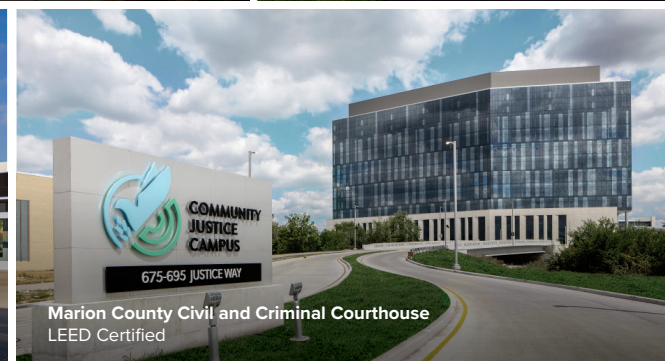
Marion County Civil and Criminal Courthouse LEED Certified