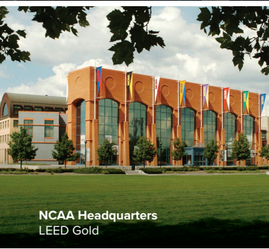
NCAA Headquarters LEED Gold