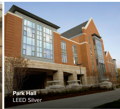
Park Hall LEED Silver