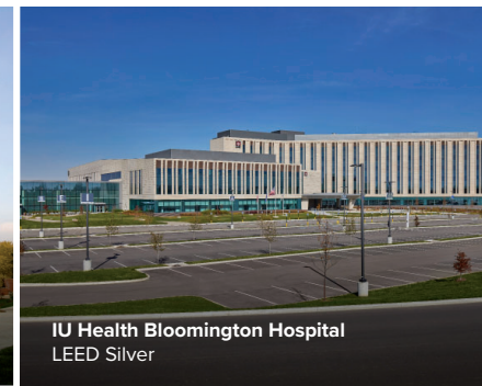
IU Health Bloomington Hospital LEED Silver