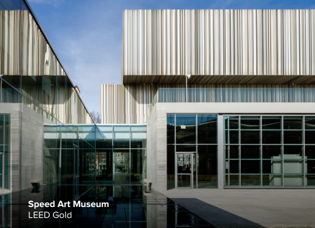
Speed Art Museum LEED Gold