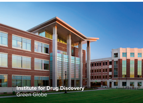
Institute for Drug Discovery Green Globe