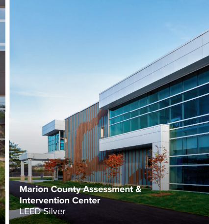
Marion County Assessment & Intervention Center LEED Silver